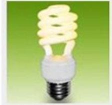
Energy Saving Tips