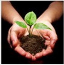
Commitment to Sustainability