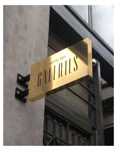
Embossed Metal Blade Signage