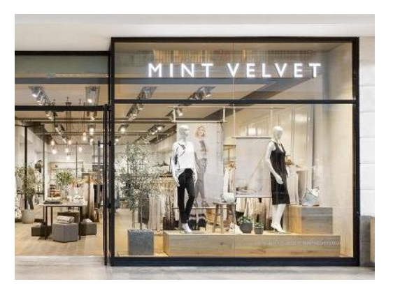
Individual Illuminated Channel Letters