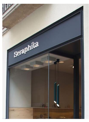
Serif Dimensional Lettering