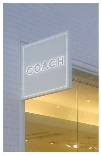
Illuminated Blade Signage