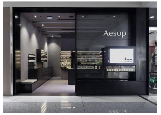
Vinyl Lettering* & Product Showcase