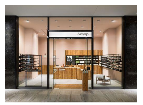
Acrylic Signage + Dimensional Lettering