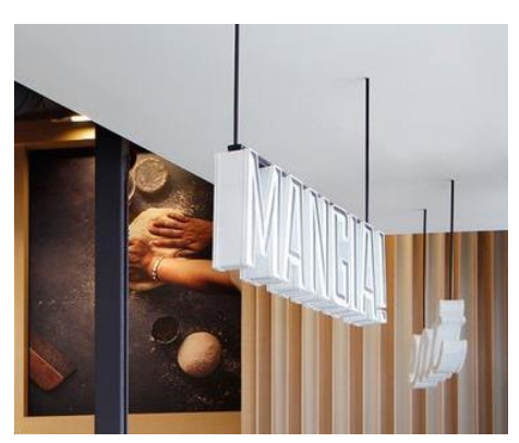
Suspended Illuminated Dimensional