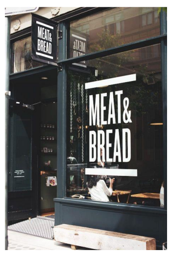
Vinyl Lettering* & Blade Signage