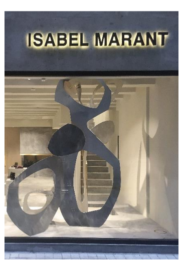
Halo Illuminated Pin Letters