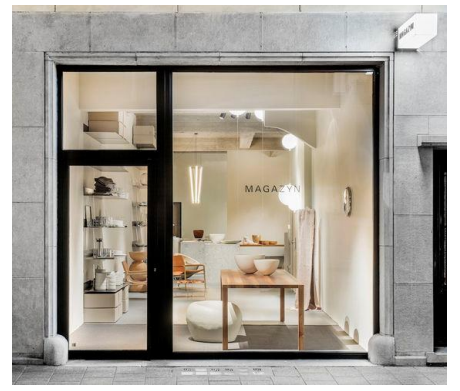
Minimalist Vinyl Lettering*