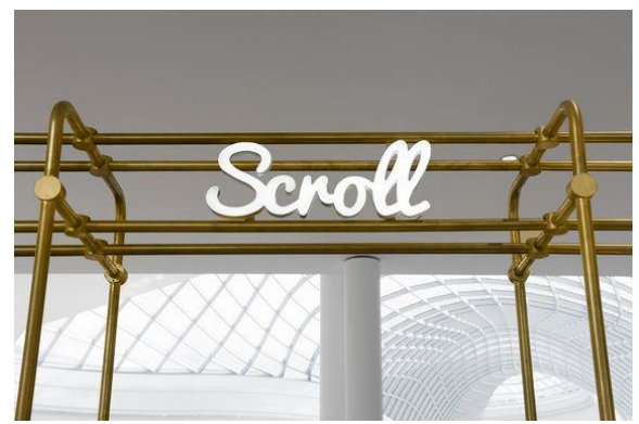
Illuminated Channel Signage