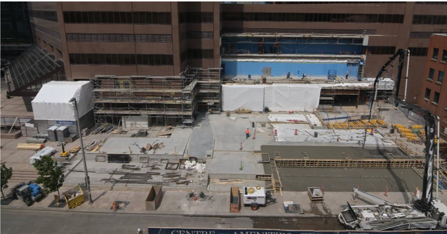
Terrace as of June 2025