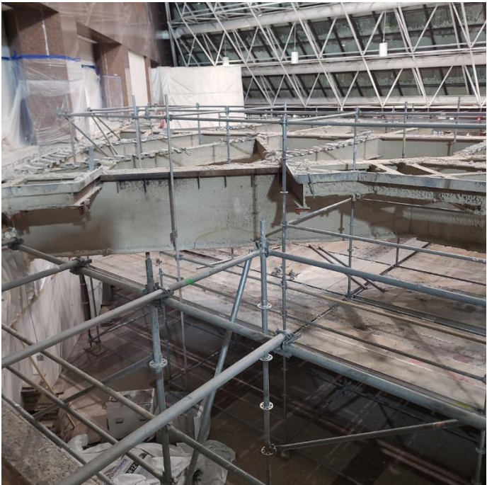
Atrium as of April 2025