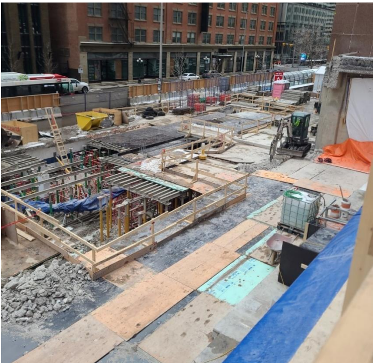
Terrace as of April 2025